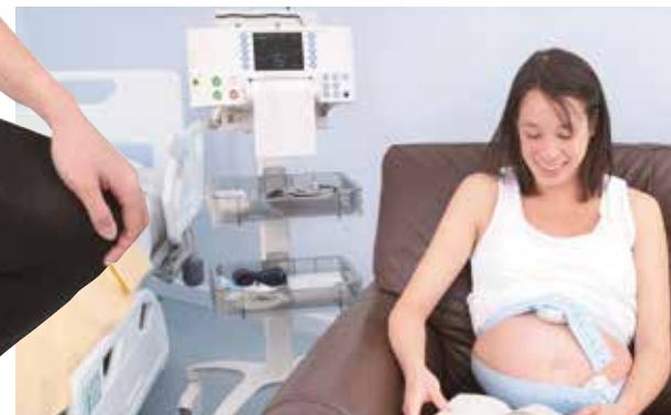
...Freedom from the constraints of a bed