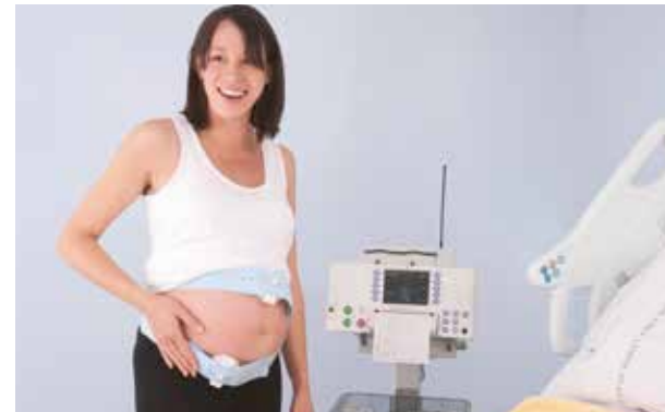
...Freedom to move